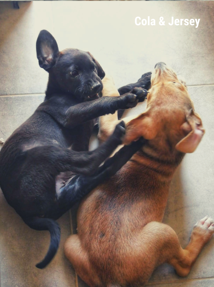
Cola & Jersey